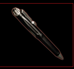
SUREFIRE PEN item #: EWP-01-BK www.surefire.com/pen