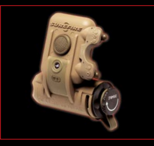
HELMET LIGHTS $159 www.surefire.com/helmetlights