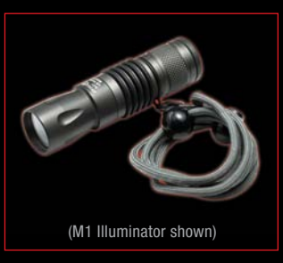
INFRARED [IR] LIGHTS Visit www.surefire.com and search using keyword "IR"