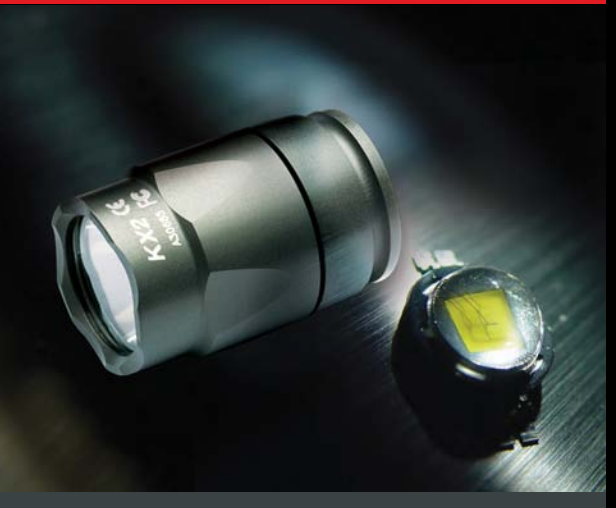
* Note: Despite their many advantages, LEDs put out minimal Infrared radiation, so they're not suitable for IR uses. SureFire incandescent lights are better suited for operations requiring both Infrared and white light.