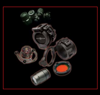
SUREFIRE ACCESSORIES www.surefire.com/accessories