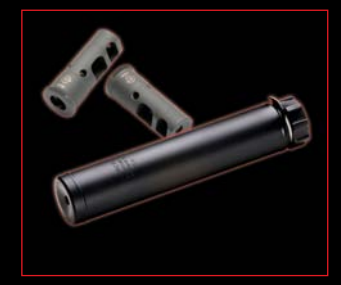
SUPPRESSORS & ADAPTERS www.surefiresuppressors.com