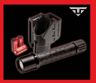
G3™ LED HOLSTER KIT $140 item #: G3L-BK-KIT01 www.surefire.com/g3holsterkit