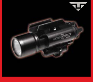
X400™ $455 item #: X400 www.surefire.com/x400