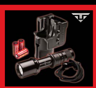
Z2<sup>®</sup> LED HOLSTER KIT $169 item #: Z2-BK-KIT01 www.surefire.com/z2holsterkit