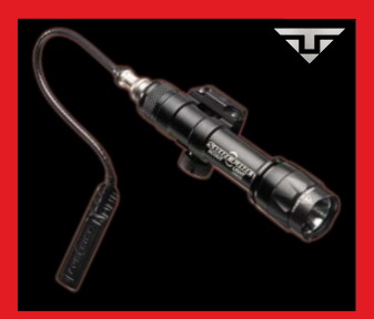
LONG-GUN WEAPONLIGHTS www.surefire.com/weaponlights