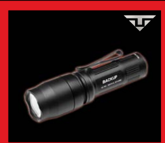
E1B BACKUP™ $149 item #: E1B-BK-WH www.surefire.com/backup