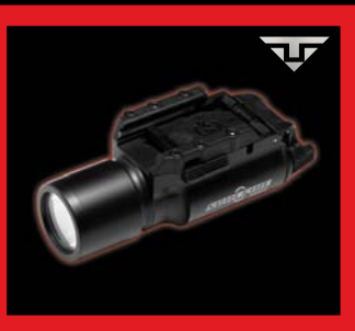
X300® item #: X300 www.surefire.com/x300