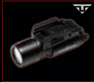
X300® $249 item #: X300 www.surefire.com/x-series