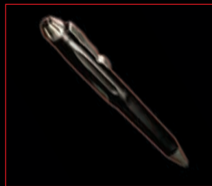
SUREFIRE™ PEN $125 item #: EWP-01-BK www.surefire.com/pen