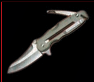
L.E.O.® KNIFE $423 item #: EW-08 www.surefire.com/leo