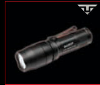
E1B BACKUP® $149 item #: E1B-BK-WH www.surefire.com/backup