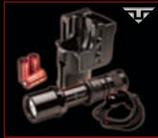
Z2 LED HOLSTER KIT $169 item #: Z2L-BK-KIT01 www.surefire.com/z2holsterkit