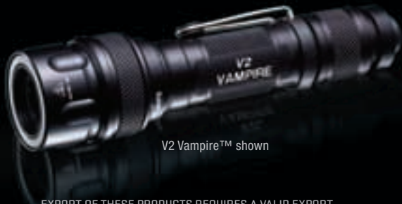
V2 Vampire™ shown

Visit www.surefire.com and search using keyword "IR" for complete list