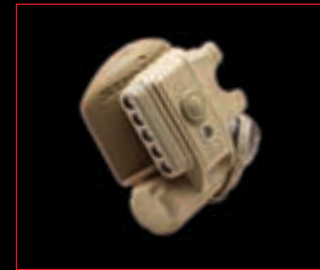
HELMET LIGHT $159 www.surefire.com/helmetlight