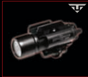
X400® $455 item #: X400 www.surefire.com/x-series