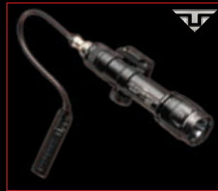
LONG GUN WEAPONLIGHTS www.surefire.com/weaponlights