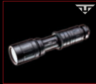
AZ2 COMBATLIGHT® $260 item #: AZ2-BK-WH www.surefire.com/az2