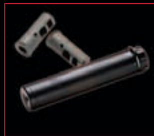
SUPPRESSORS & ADAPTERS www.surefiresuppressors.com