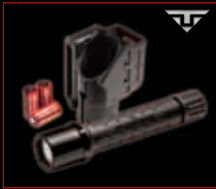
G3® LED HOLSTER KIT $140 item #: G3L-BK-KIT01 www.surefire.com/g3holsterkit